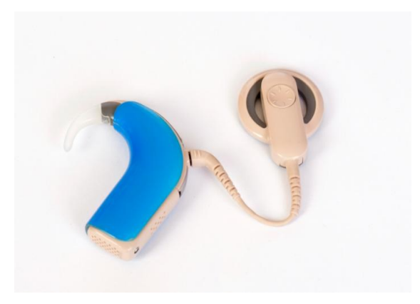
Cochlear implants were found to improve the cognitive function, speech perception and depressive symptoms of older adults with profound hearing loss.